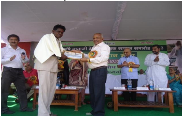
Rashtra Rishi Nanaji Deshmukh Innovative farmer award