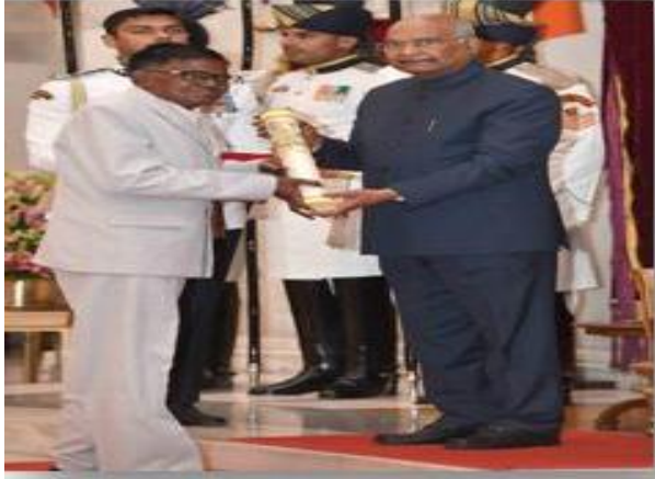
Recipient of Padma Shri award 2018