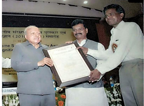
Recipient of Plant Genome saviour award 2012